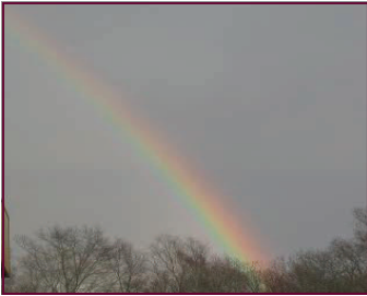
A Rainbow over Dodd Stadium must mean Good Luck!